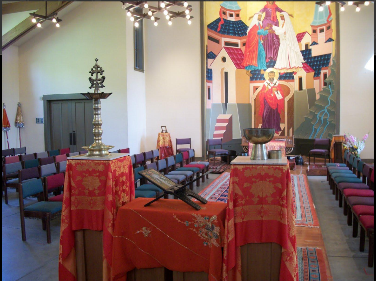
Saint Gregory of Nyssa Church—the “word/proclamation” space San Francisco