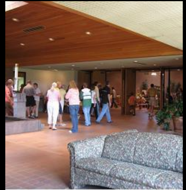
St. Ann Church, Long Grove, IA