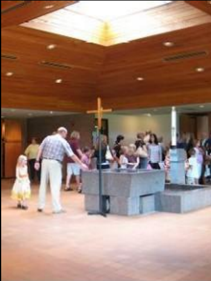
St. Ann Church, Long Grove, IA

http://www1.georgetown.edu/centers/liturgy/envisionchurch/60835.html